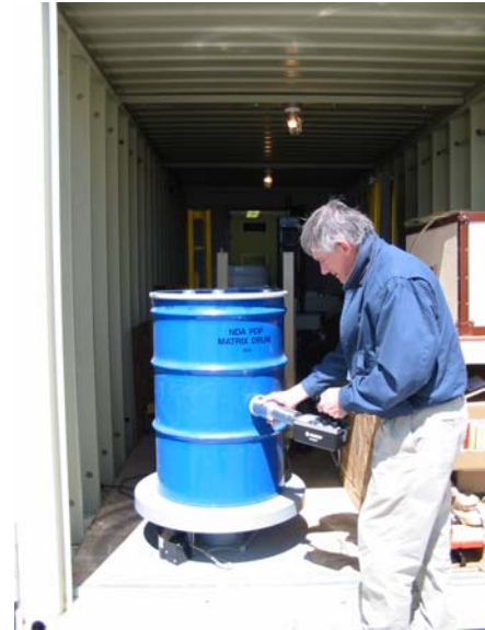
Fig. 3 Drums were scanned for localized activity

The four drums containing rods simulating the four matrices were loaded with different quantities of sources. Sixteen items were counted with different ranges of activity.