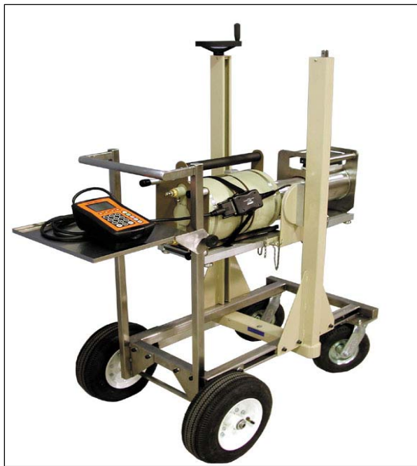
Fig. 1 ISO-CART measurement system

Libraries containing information about expected nuclides were developed using the gamma-ray branching ratios for every gamma ray expected in the spectrum. Reference gamma rays were selected for each nuclide. The activities of all the gamma rays are determined, but only the reference gamma ray was used for the reported results. The best reference gamma rays selected for reporting were gamma rays that are high energy, intense, and free from interference. In practice, many high-energy gamma rays are not intense and compromises are made between high energy and intensity. The reference gamma ray used for 239 Pu analysis was the 413.7-keV gamma ray. This is not the most intense gamma ray emitted during 239 Pu decay, but its medium energy is more penetrating than the more intense 129.3-keV gamma ray. The reference gamma ray at 185.7 keV was used for the 235 U quantification.