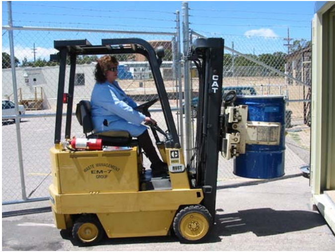
Fig. 2 Drums were positioned with a fork lift