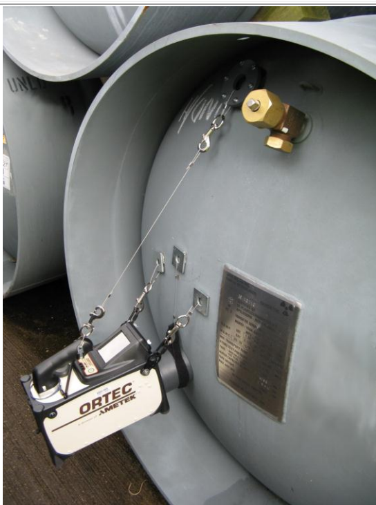
Fig. 3. ECGS hung in measurement position on 30B cylinder

The U-235 enrichment measurements were performed for \text{NUF}_6 and \text{DEUF}_6 material in 30B cylinders. The results of the measurements are shown in Table 1.