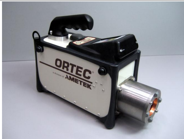
Fig. 1. Electrically Cooled Germanium System