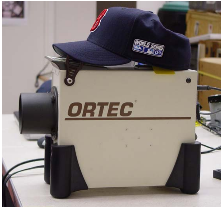
Figure 3: Ortec Detective mechanically-cooled HPGe detector.

Recently INL began design of the next generation PINS system, and to simplify logistics for military customers, it will use a modified version of Ortec's Detective mechanically-cooled HPGe detector to eliminate the need for liquid nitrogen cooling. The Detective contains a digital signal processing MCA and sufficient battery power for three hours operation in a compact 10 kg package, as shown in Figure 3.