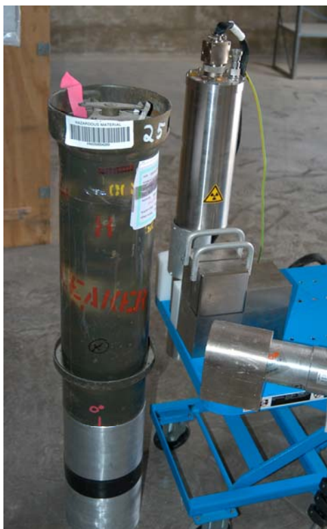
Figure 4: A SODERN neutron generator irradiates a mustard-agent filled 4.2-inch mortar projectile during a test assay at U.S. Army Dugway Proving Ground, September 2003. For safety, the mortar projectile is overpacked inside the air-tight olive-drab steel can stenciled “LEAKER.”

Previously, Lawrence Livermore National Laboratory tested a neutron generator-based PGNAA system for chemical warfare agent identification in 1992,[6] and more recently, Brüker and SAIC have produced commercial PGNAA instruments for explosive and CW agent identification that employ neutron generators.[7,8]