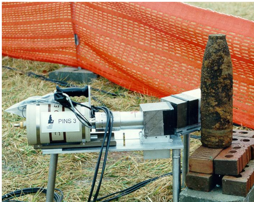
Figure 2: A 4.7-inch artillery projectile during assessment in the Spring Valley neighborhood of Washington, D.C., January 1993. PGNAA determined this “non-stockpile” projectile contains an incendiary chemical. The projectile was likely buried in 1919.

these commonly include smoke-generating substances such as titanium tetrachloride and white phosphorus. In addition, in countries where chemical warfare (CW) agents have been stored, tested, or used in battle, the list of non-stockpile munition fill chemicals expands to include blister agents, choking agents, nerve gases, and other CW agents. Finally, many armies train with practice munitions, and practice munition fills include sand, concrete, water/antifreeze mixtures, and plaster-of-Paris.