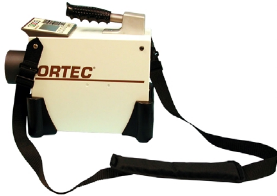
Figure 1. DETECTIVE Portable Radioisotope Identification System (RIID).

The ORTEC DETECTIVE™ family members are the only commercially available radioisotope identification (RIID) devices which use High Purity Germanium (HPGe) technology. The DETECTIVE (see Figure 1), introduced in 2003, positively identifies the radionuclides present in the source and classifies them as “industrial” “medical”, “natural” or “nuclear” in nearly any type of measurement situation.