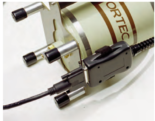
SMART-1 Detector Interface Module.