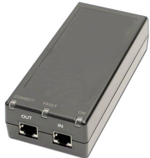
Power over Ethernet (PoE) Single Port Injector

A11-B32 CONNECTIONS-32 Programmer's Toolkit with ActiveX Controls: Write your own special software to control the digiBASE-E from LabView, Visual C++, or Visual Basic. List mode operations are available only using your own custom software.