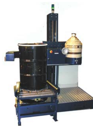
TGS with conveyor

As the attenuation and source distribution matrix is known more accurately than in an SGS, biases due to matrix and source distributions are significantly reduced. As a result, a single calibration constant can be used for the determination of isotope mass for a wide range of material and matrix types. Isotopic ratio analysis of Pu is performed using PC/FRAM code. An 8K channel spectrum is obtained for isotopic analysis during the TGS scans.